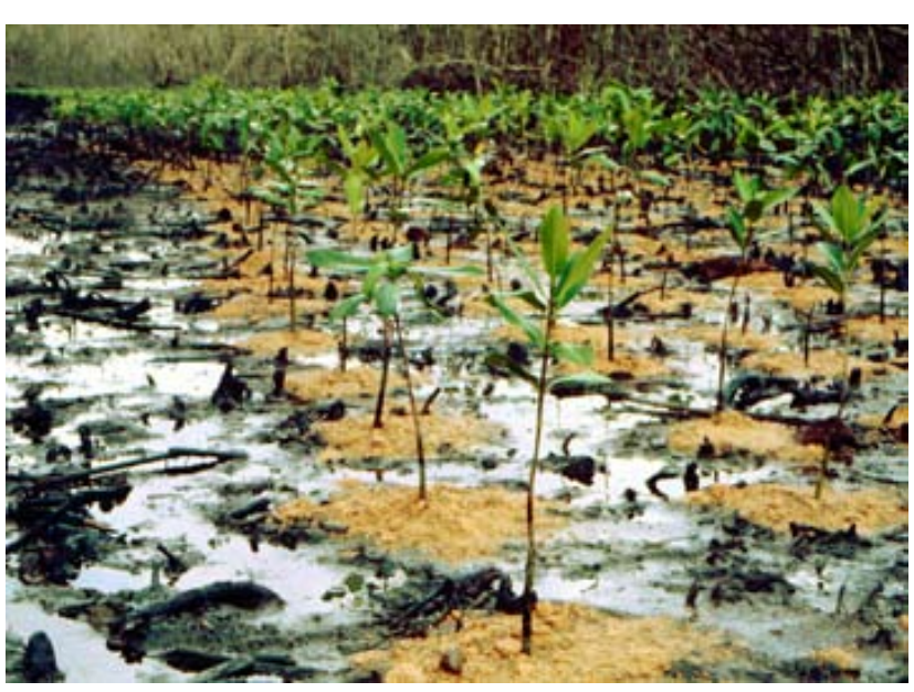
Planting of red mangroves in an attempt to replace around 50 ha of tree loss following a major oil spill in Bahia las Minas, Atlantic Panama.