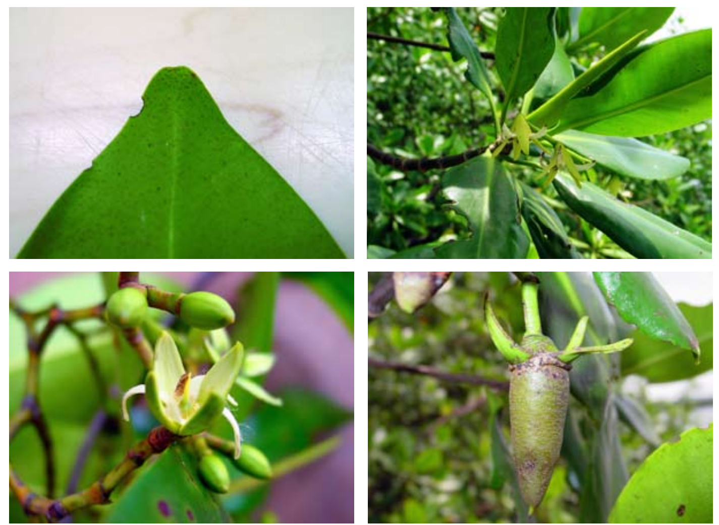
Top left: The blunt apex of leaves is characteristic of all AEP red mangroves, as in this R. samoensis from Fiji. Top right: Leafy rosette of Rhizophora mangle (similar to R. samoensis ) showing open flowers with elongate, reflexed calyx lobes. Bottom left: Open flower of Rhizophora racemosa showing flat, slightly hairy petals and stiff-erect, non-reflexed calyx lobes. Bottom right: Mature fruit of Rhizophora mangle (similar to R. samoensis ) showing its elongate pear-shape, prior to emergence of the hypocotyl. Note the persistent style at the distil tip of the fruiting body. Atlantic Panama.

axils 3, 7 (rare) and 10–11 nodes down from apical shoot, respectively.