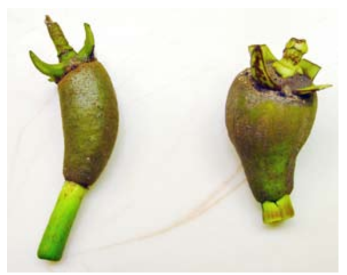
Expended fruits of Rhizophora samoensis (left) and R. stylosa (right), Fiji.