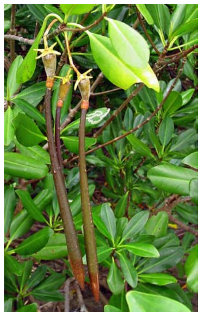
Mature hypocotyls of Rhizophora mangle (similar to R. samo-ensis ), showing distinctive brown distal end, Hawai'i.