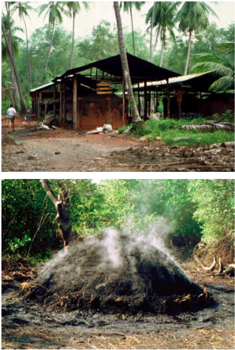
Top: Charcoal treatment plant established with the DANIDA Mangrove Project in Pacific Costa Rica, supported by IUCN and CATIE. Bottom: Typical earthen kiln used to convert stacked red mangrove poles into charcoal for local heating needs, Pacific Panama.

areas. Because the soils were oiled it was decided to plant R. mangle seedlings using clean terrestrial sediments. Total plantings eventually amounted to in excess of 100,000 seedlings. A subsequent investigation (Duke 1996) found natural recruitment was 40 times greater than planted numbers, and natural seedlings grew equally as well as, or better than, planted seedlings. It was of great importance that naturally recruited sites recovered more quickly than planted sites, possibly because of site damage during planting. Furthermore, damage to exposed and damaged man-