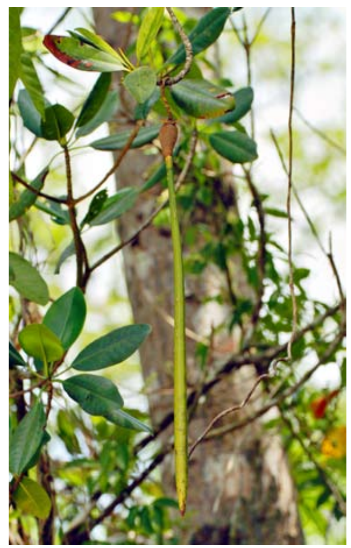
Mature hypocotyl of Rhizophora racemosa showing distinctive, slender, smooth propagule, Brazil.

longer, but storage beyond 2 weeks is not recommended, and long-term storage is not feasible.