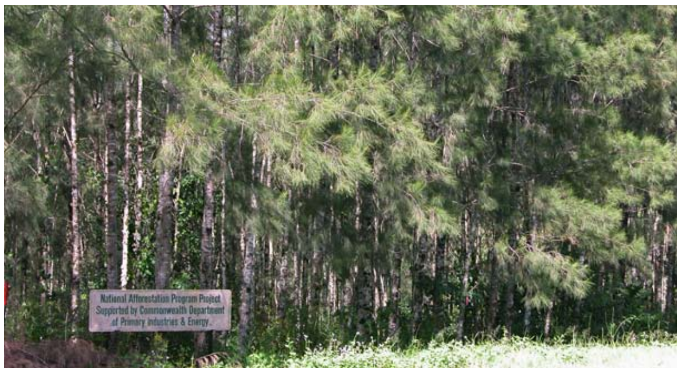
A dense planting of beach she-oak makes a good woodlot for fuelwood and charcoal.