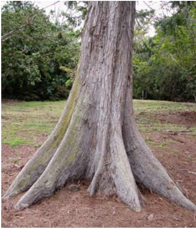
Buttresses on beach she-oak.