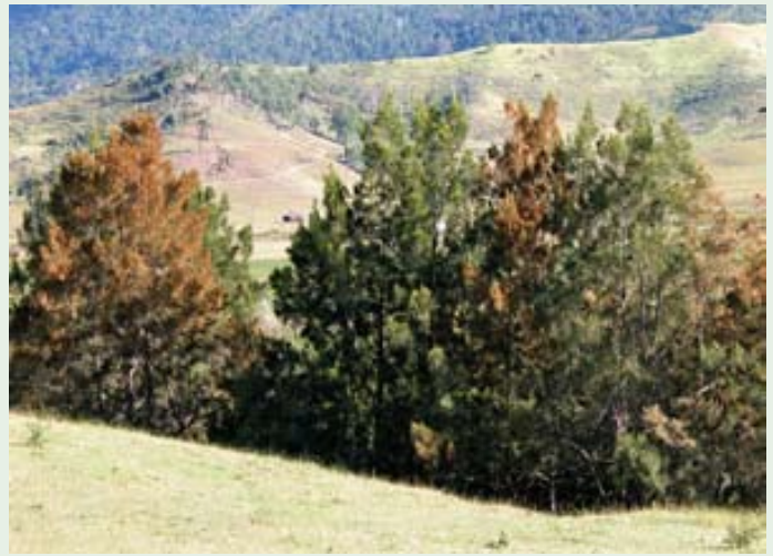
Left: Fruits and female flowers of C. cunninghamiana . Right: Male and female river she-oak. The males appear brownish when in flower. Queensland, Australia.