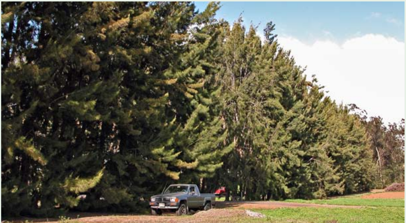
A windbreak of C. cunninghamiana protecting crop land. Waimea, island of Hawai'i.

It generally occurs on well drained, light-textured sandy or gravelly soils, although it is occasionally found growing in clayey soils. The pH is acidic to neutral. The tree