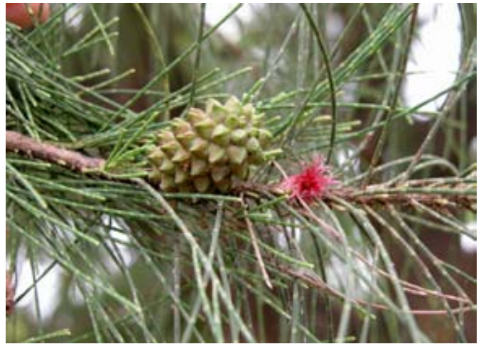
Fruit and flower, approximately life size.

Fruit is a woody, ovoid to subglobose, cone-like head 1.2–2.2 cm (0.5–0.9 in) long, formed from the persistent, valve-like bracteoles pubescent on the outside, these separating at maturity to release the nut.