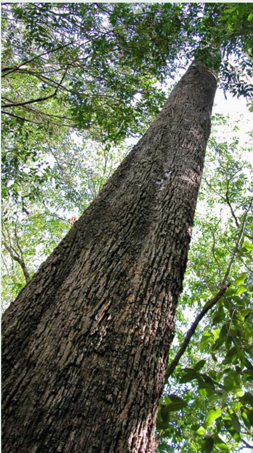
Clear, straight trunk of an older river she-oak.

The wood makes an excellent fuelwood and charcoal. Although very difficult to work, the wood can be sawn into planks and cured using special methods. The wood has also been used for casks, tool handles, turnery, flooring, and as a general utility farm timber. Particleboard has also been made from the wood. The heartwood is said to be durable in contact with the ground for 15–25 years. The foliage can be used as a low-grade animal fodder during times of shortage. A dye can be made from the leaves. The flowers are an important source of pollen for bees. A recent introduction to Pacific islands, there are no known traditional uses in the region.