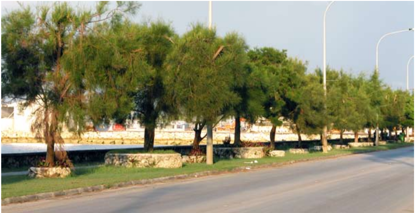
Beach she-oak makes a very good hedge, visual barrier, or windbreak, and can be repeatedly pruned as is done here in Nuku'alofa, Tonga.

wood termites. Poles are used as masts for fishing boats, boat oars, piles, and posts.