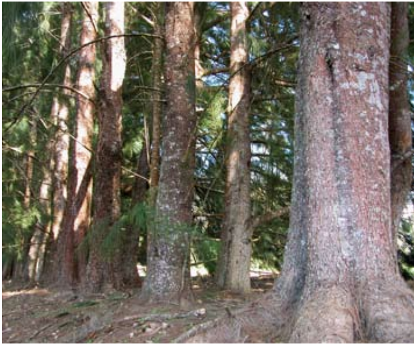
Windbreak spacing is typically 2 x 2 m (6 x 6 ft).