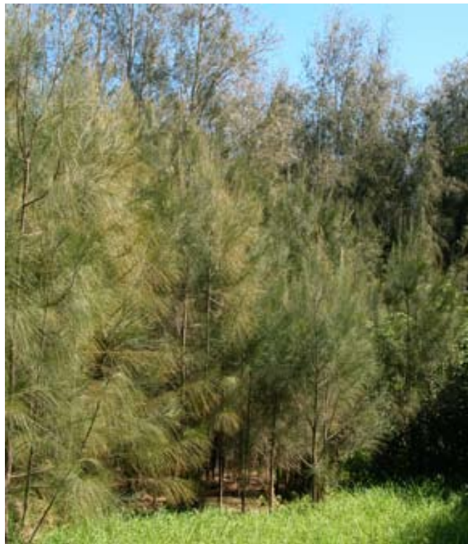
Many Casuarina species are considered highly invasive, and should not be introduced to new areas. Here beach she-oak invades open pasture, Waimea, island of Hawai'i.

Many people believe that beach she-oak is competitive