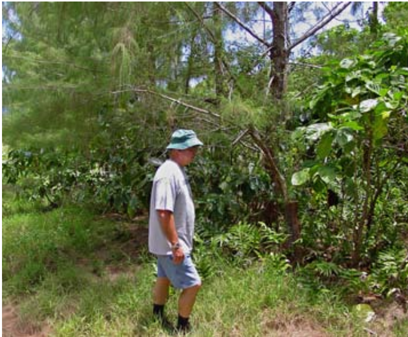
Noni ( Morinda citrifolia ) growing under beach she-oak.