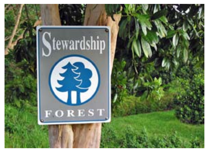
The Forest Stewardship Program is one of many programs offering financial assistance for landowners who are investing in forests.

Hawai'i Forest Industry Association (HFIA) P. O. Box 10216 Hilo Hawai'i 96721 Street address: 162 Kino'ole Street, #101 Hilo, Hawai'i 96720-2816 Tel: 808-933-9411; Fax: 808-933-9140 E-mail: info@hawaii-forest.org Web: http://www.hawaii-forest.org/