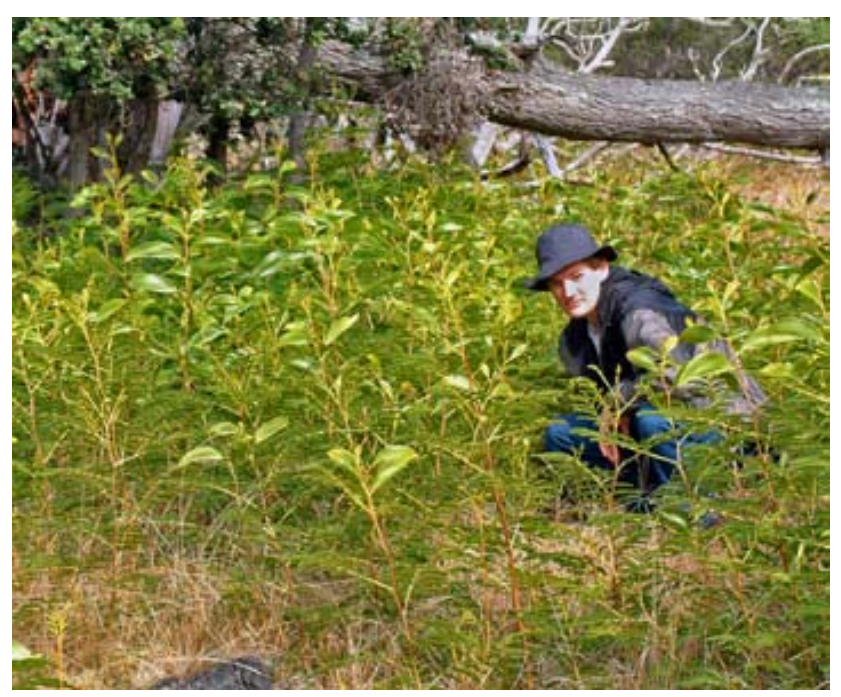
Travis Idol observes koa root sprouts springing up after removal of cattle, Mauna Loa.

Mature native forests contain diverse tree species and may have only a few koa trees per hectare. Koa will not regenerate in forest shade or even under its own sparse canopy, nor is it able to grow up through the canopy of other trees. Once a koa tree is overtopped by another tree, its growth ceases. In natural forests with only a few very large koa per hectare, koa probably depends on large tree-fall gaps to regenerate. Stands of young koa can be seen growing up adjacent to large ancient stumps left over from logging or huge stems that were toppled by storms. Silvicultural systems for koa forest regeneration can rely on natural regeneration through the seed bank, but enough light must reach the forest floor for young koa trees to grow. Harvesting systems in dense mixed-species forests where single trees are selected and cut are likely to result in "high-grading" or the removal of the koa from the forest rather than the regeneration of a healthy koa forest. "Group selection" sys-