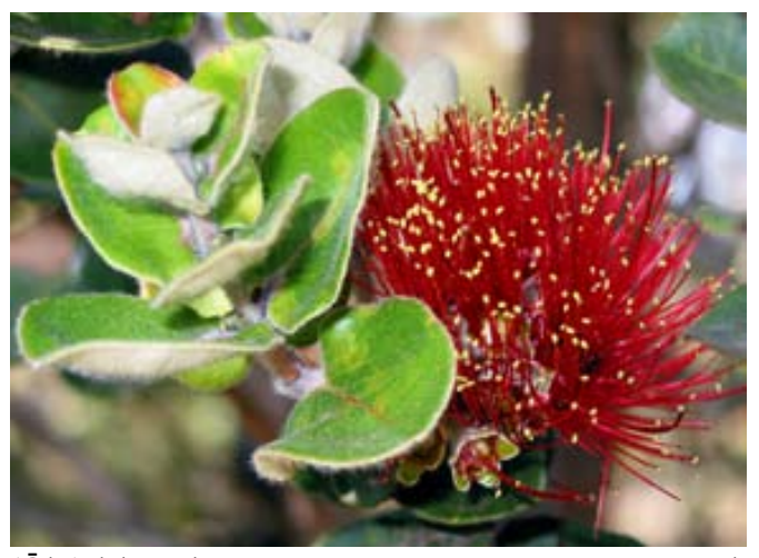
'Ōhi'a lehua, the most common native Hawaiian tree, is almost always found growing with koa.

sandwicensis), and pilo ( Coprosma spp.). In wetter sites, tree ferns ( Cibotium spp.) may be prominent in the understory, while other species of ferns such as palapalai ( Microlepia strigosa ) and Dryopteris wallichiana cover the ground. The native Hawaiian raspberry or 'ākala ( Rubus hawaiensis ) and the shrub māmaki ( Pipturus albidus ) are also common in the understory of koa forests. At higher elevations the forest gradually becomes dominated by māmane ( Sophora chrysophylla ) (Mueller-Dombois and Fosberg 1998). Today, many koa forests consist of scattered old trees in rangelands dominated by kikuyu grass ( Pennisetum clandestinum ).