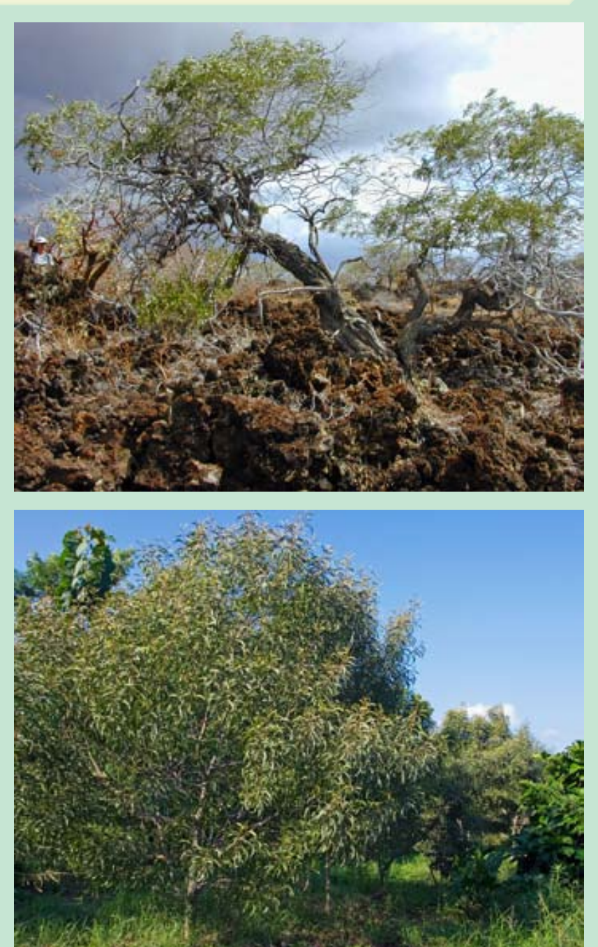
Top: Gnarled framework of old koai'a tree, Pu'u o kali, Maui. Bottom: Hedge of koai'a along property boundary, Kailua-Kona, Hawai'i.

Koai'a is often a better choice than koa in landscaping due to its smaller size and tolerance for harsher, drier conditions. However, as with koa, the tree is susceptible to dis-