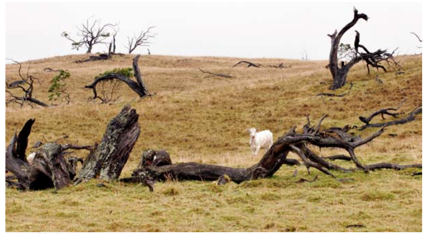
Dying and dead koa trees in pasture.