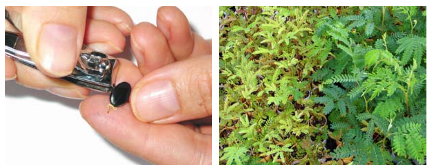
Left: Breaking seed coat dormancy through scarification is important to ensure fast and uniform germination; the nicking method is shown here. Right: Seedlings that were not inoculated with rhizobia (on left) were pale and less vigorous than their same-age, inoculated counterparts (on right).