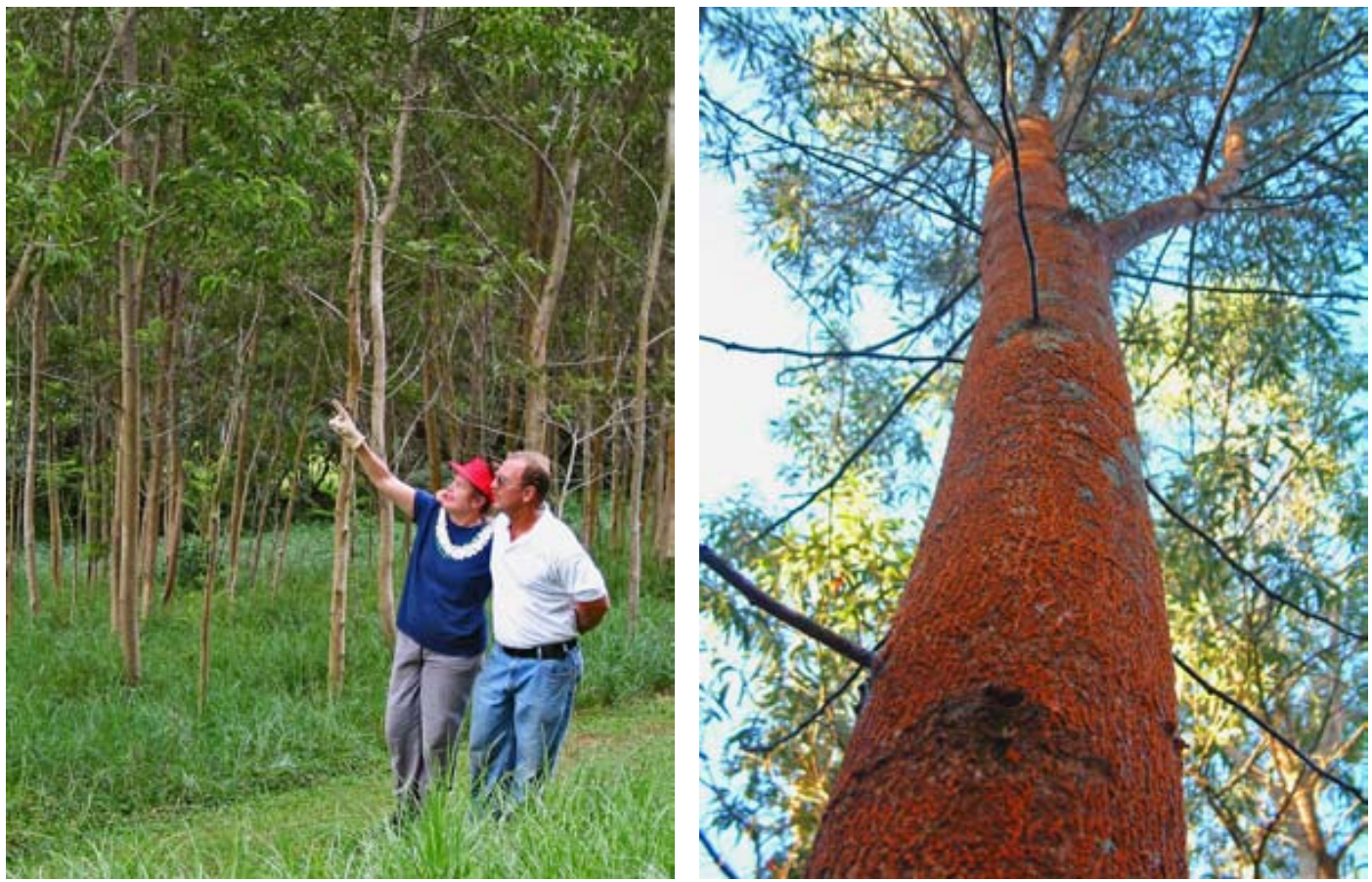
Left: Muriel and Kent Lighter show trees that were planted in circles of six to eight seedlings. After 5 years there are about 400 trees/acre, and the best trees will be released by thinning out the poorer trees. Right: Koa trees self-prune when grown in dense stands.

native plants such as palapalai ( Microlepia strigosa , an ornamental fern used in the hula), maile ( Alyxia oliviformis , a scented vine), māmaki ( Pipturus albidus , a native nettle used to make a medicinal tea), and pepeiao ( Auricularia , an edible fungus) show promise. Koa plantations allow light to penetrate the canopy and usually support a grass understory, which may be grazed occasionally by livestock if care is taken to avoid damage to the trees (see section on silvopasture, below).