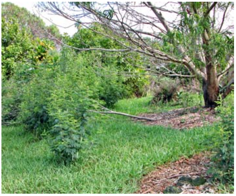
Root suckering (on left) occurs frequently when a tree is severely stressed (on right) or when surface roots are damaged.

tive koai'a ( Acacia koaia ). The rare koai'a is a shorter tree with a bushy, often gnarled habit, primarily of drier areas of Kaua'i, Moloka'i, Lāna'i, Maui, and Hawai'i (see koai'a section below).