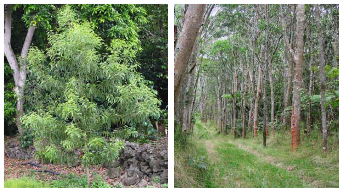
Left: Koa boundary for coffee orchard. Right: 23-year-old koa regeneration at Keauhou Ranch, Hawai'i.