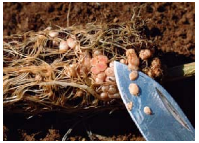
Pink nodules on the root system of a koa seedling, indicating active nitrogen fixation.

soil, competition from weeds, relative humidity, winds, and other factors.