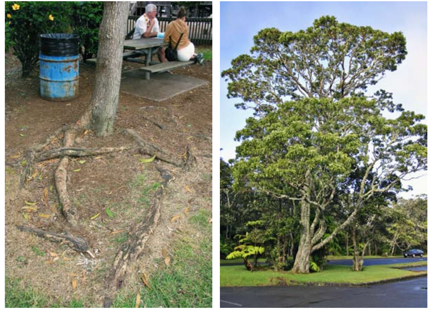
Left: Damage to surface roots and trunk causes undue stress. Right: In the right conditions, and with proper care, koa trees can live many years in a landscape, Volcanoes National Park, Hawai'i island.