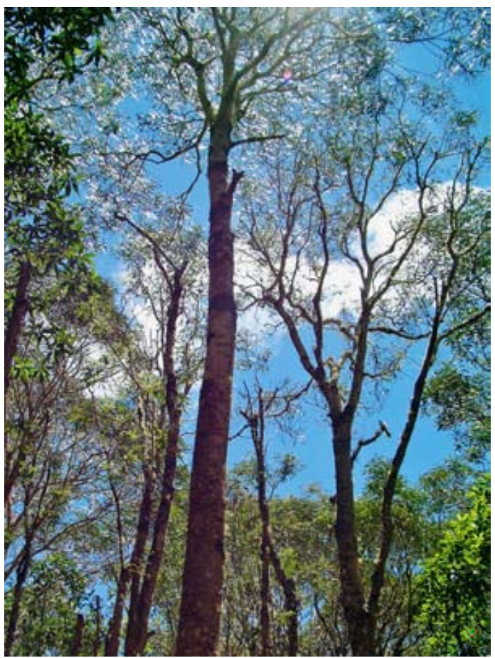
Koa casts a light shade (23-year-old koa trees at Keauhou Ranch, Ka'ū, Hawai'i).

Many native Hawaiian birds depend on koa forests directly or indirectly for habitat. Large old trees provide important nest sites. Commonly seen birds include the red 'apapane ( Himatione sanguinea ) and 'i'iwi ( Vestiaria coccinea ), the yellow 'amakihi ( Loxops virens ), and the inquisitive 'elepaio