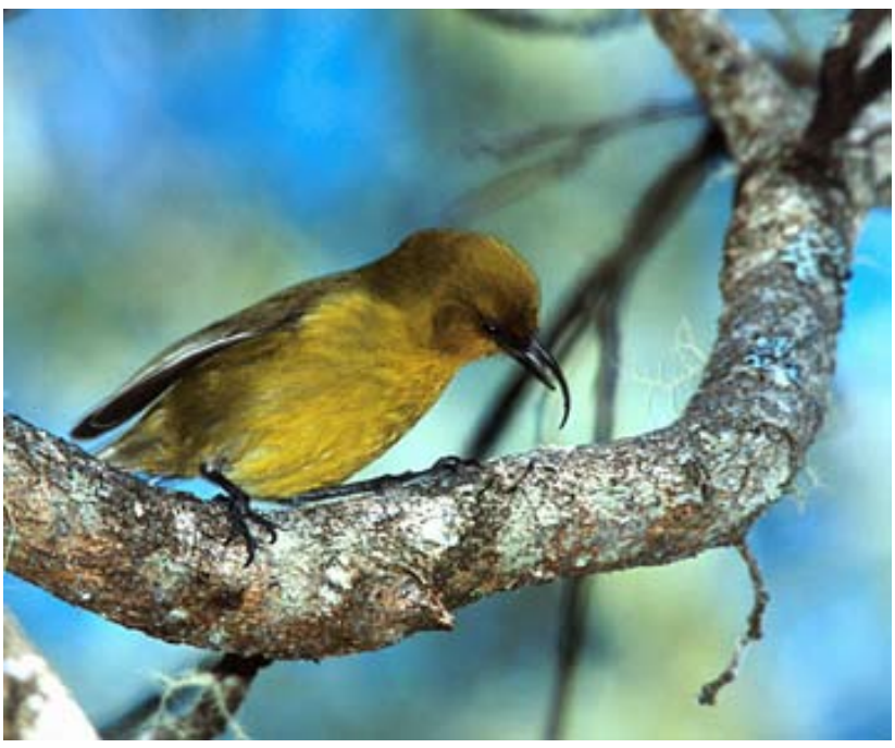
'Akiapola'au on koa branch.

Koa was traditionally used for canoes (wa'a), from one-person fishing canoes to the huge voyaging canoes that could sail between islands and across vast expanses of ocean. In