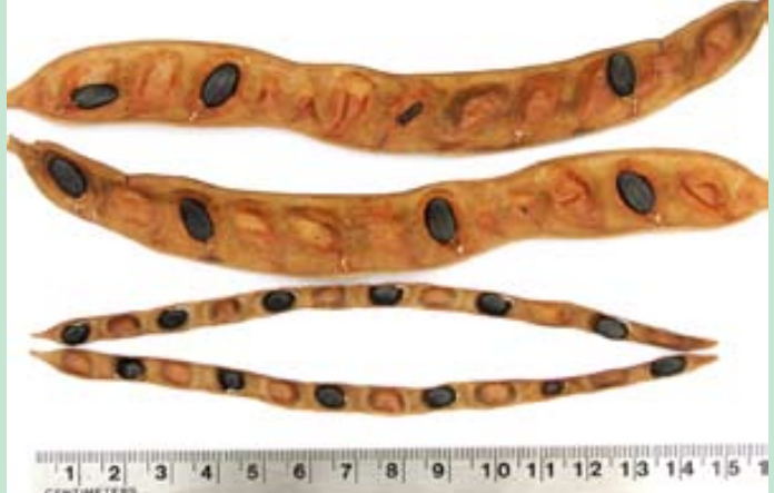
Top: Remnant koai'a trees growing in open, dry area, North Kohala, Hawai'i. Middle: Koai'a leaves and flowers. Bottom: Koa seeds are arranged transversely in the seedpod (above), while koai'a seeds are arranged longitudinally (below). This is one of the identifying traits of koai'a.