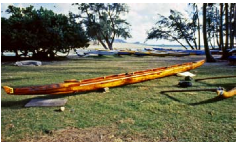
Modern day koa racing canoe (outrigger detached on right) named Lanakila Mau O Ka Lōkahi.

ancient times, the cutting of a forest giant with stone tools to make a canoe was an undertaking of several days for many men, involving many ceremonies and prayers. When a log was felled, it is said that the men watched for a sign from the 'elepaio bird. If the bird landed on the log and pecked at it, the log would be abandoned. Today, large "canoe koa" have all but disappeared. A single koa log large enough for a traditional Hawaiian voyaging canoe should be 10–14 m (35–45 ft) long and 120 cm (48 in) in diameter along the entire length of the log. Shorter logs may be spliced together to make larger canoes. Smaller logs of 75–90 cm (2.5–3 ft) in diameter are used for racing or fishing canoes. Canoe carving is a living tradition in Hawai'i