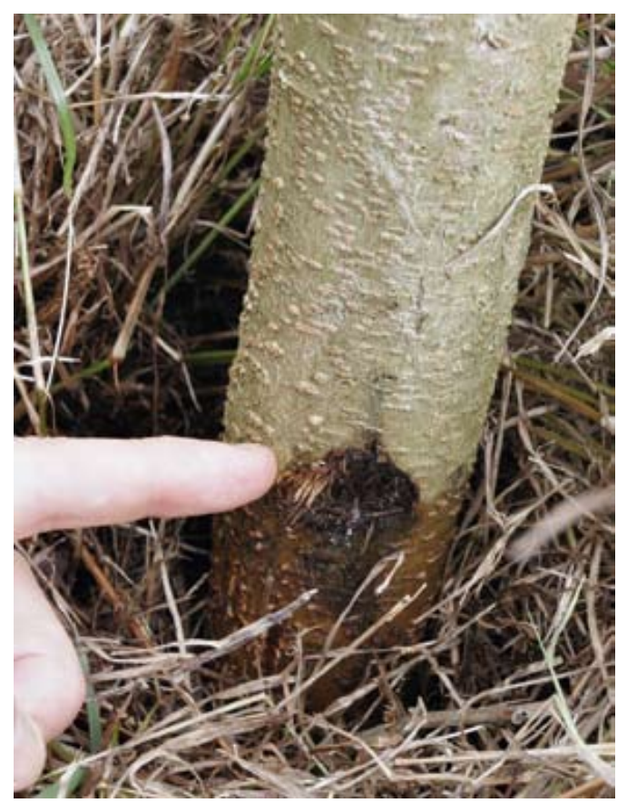
Damage with a power weed cutter happens in an instant and seedlings usually never recover.

bacteria selected for this species (available from commercial suppliers or from nodules collected from the roots of healthy forest trees). Strains of rhizobia selected by researchers are best for optimum nodulation and nitrogen fixation.