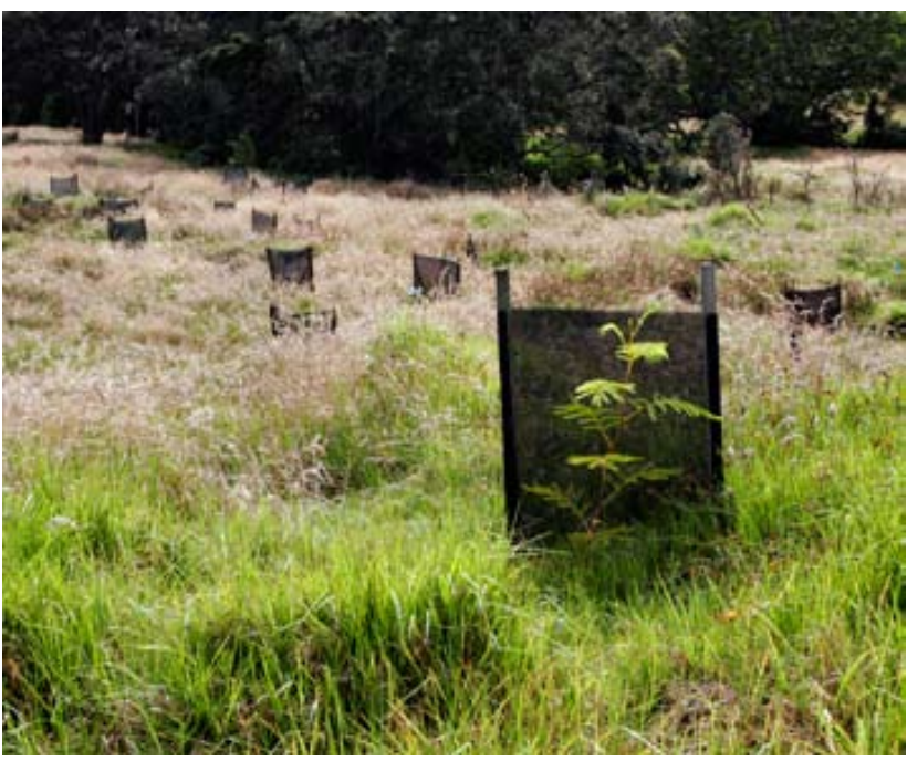
After an overnight frost, young seedlings may be killed by overly rapid thawing caused by direct sunlight. Here sun screens are placed to shield seedlings from early morning sunlight, giving seedlings time to slowly warm up. Hakalau National Wildlife Refuge, Hawai'i.

Koa can tolerate drought for 3-5 months, depending on