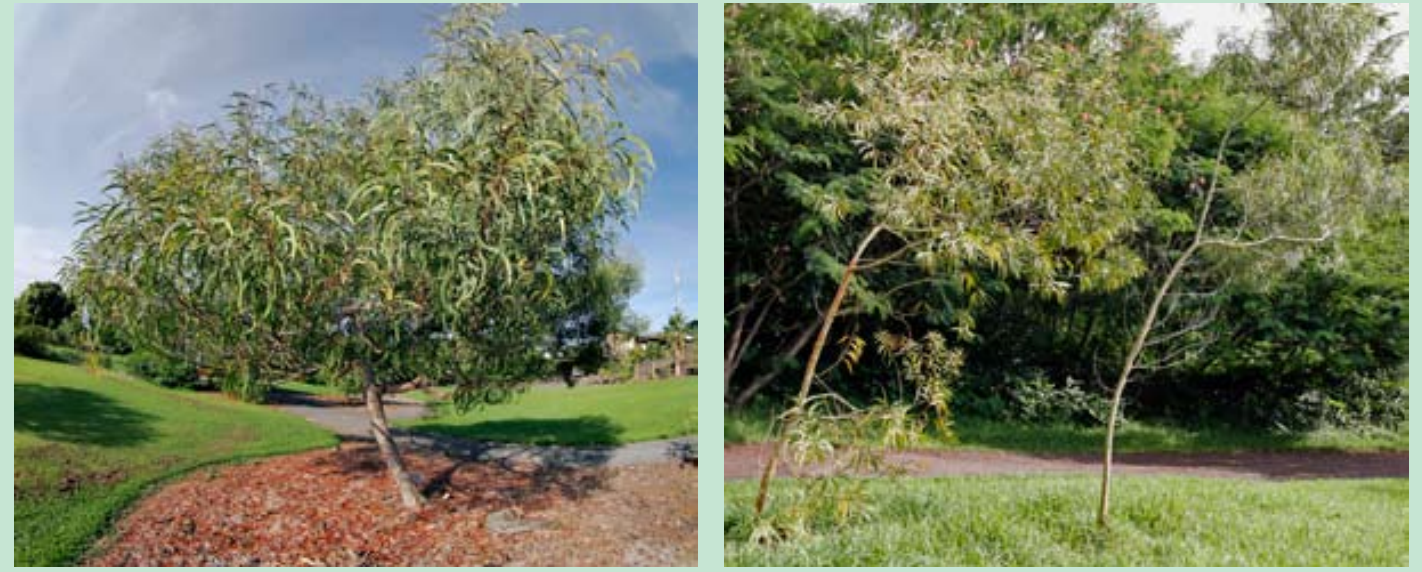
Left: Twelve-year-old koai'a tree growing along path at Amy Greenwell Ethnobotanical Garden, Kealakekua, Hawai'i. Right: When grown in a lawn, koai'a and koa become spindly and stressed.

Koai'a foliage is somewhat more gray-silver than koa, and