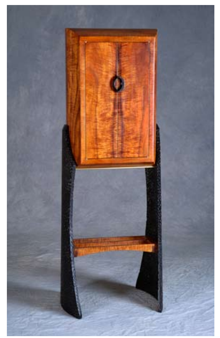
Cabinet of curly koa by Marian Yasuda.

Common pests include pathogenic fungi and twig borers. Avoiding overwatering and damage to roots, trunk, and branches may reduce the risk of attack by pathogenic fungi. Twig borers tend to attack seasonally, usually during dry periods, and healthy trees recover. Trees also can recover from light seasonal damage by whitefly, beetles, thrips, scale insects, Chinese rose beetle, and mites. Leafhoppers that cause defoliation and stippling of the leaves can be treated with soapy water.