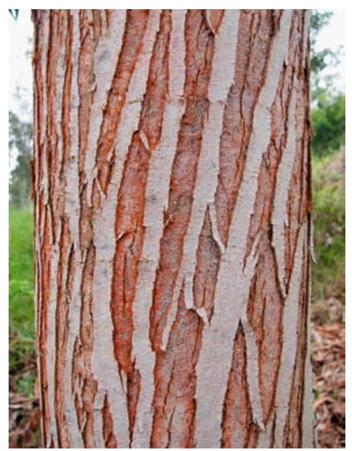
Transformation of bark from smooth to rough.

In many areas, koa flushes with new growth nearly yearround, slowing during dry or cool periods. Flowering takes places throughout the year in some areas and is strongly seasonal in others.