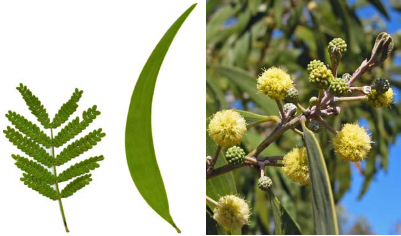
Left [scale: <sup>1</sup>/<sub>3</sub> size]: Young koa trees have true leaves (on left). At about 6–9 months of age, trees begin producing flattened, elongated leaf stems called phyllodes (on right) instead of true leaves. Right: Flowering branch tip.

Sickle-shaped phyllodes ("leaves") at maturity distinguish it from "haole koa" ( Leucaena leucocephala ); larger stature, larger phyllodes, and paler yellow and larger flowers distinguish it from Formosan koa ( Acacia confusa ); longer sickle-shaped phyllodes distinguish it from Australian blackwood ( Acacia melanoxylon ), which is also usually a much straighter-stemmed tree; and its much larger stature and larger phyllodes distinguish it from its close rela-