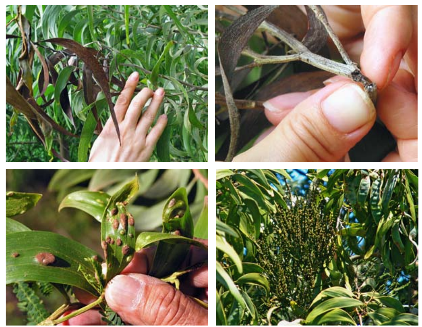
Top left and right: Damage caused by twig borer. Bottom left: Rust on phyllodes. Bottom right: Mistletoe (Korthalsella spp.).