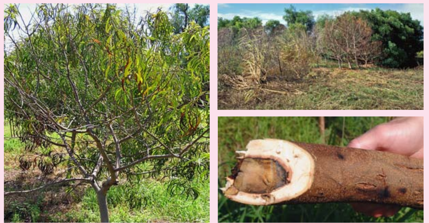
Left: Crown of a tree infected with koa wilt, showing leaf yellowing and loss. Right: Koa wilt attacking an experimental plantation and cut stem of an infected tree showing staining of the sapwood and cankers on the bark.

as the fungus is seed-borne and soilborne. Use of seed from select trees from nearby, natural stands of koa is probably the best way to avoid the disease. Seedlings should be raised in soilless media, and soil from infected areas should not be brought to the planting site. Shoes, tires, and tools should be well cleaned after leaving an infected area to remove any infected soil. Tools such as saws and machetes used in infected stands should be sterilized before being used elsewhere. Growers who plant koa in highly disease-prone areas (lands below 760 m [2500 ft] in elevation) should be prepared for high losses. In areas with no local koa populations, planting trees from several different seed sources may increase the likelihood of finding resistant trees. The presence of the pathogen will not necessarily cause disease. However, if conditions for infection are right and the pathogen is present, disease may occur.