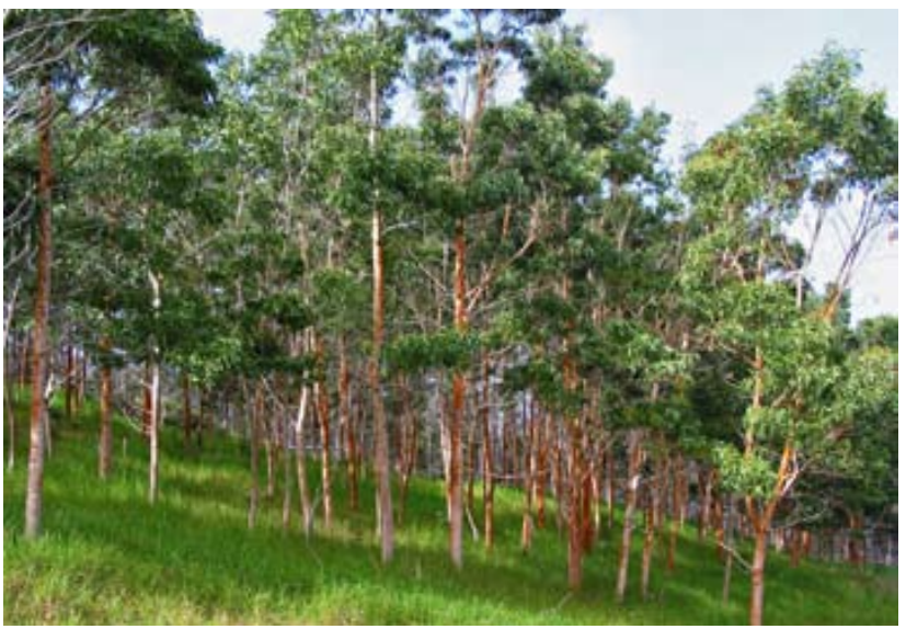
Honokōhau koa with understory maintained for brief periods by cattle and horses.

The initial density of regrown koa seedlings was 1200–5000 trees/ha (500–2000 trees/acre), which will be reduced to a final density of less than 125 trees/ha (50 trees/acre).